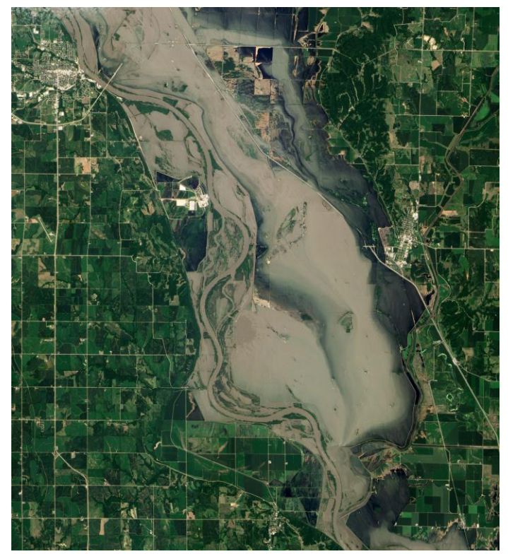
Figure 1: Satellite image of 2011 Missouri River floods.

After devastating flooding in 2011 and 2019 in southwest Iowa, the Iowa Flood Center (IFC) at the University of Iowa has developed the interactive Missouri River Flood Information System (MRFIS) to help the people of this region prepare for and reduce future flood risks.